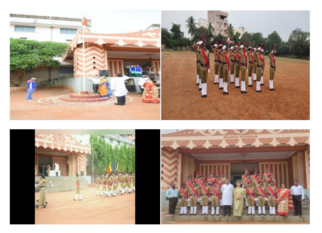
Click here to see video: <u>https://www.youtube.com/watch?v=b9j2bewoIrk</u>

On this auspicious occasion NCC cadets of St. Joseph's Degree college, Kurnool bestowed their respect for the nation, through flag salute on Independence Day-Flag hosting ceremony and performed parade.